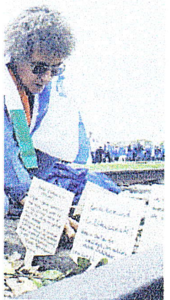
during the annual march on Monday.