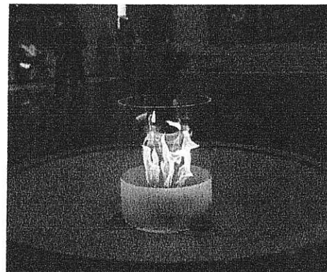
A flame burns as people read names of Jewish victims at the U.S. Holocaust Memorial Museum in Washington.

They tried to escape by train to another Polish town, but during the journey, a Polish man pressured her mother to admit that they were Jews. He